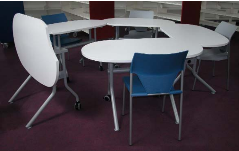
Smart Top Connect stations with flip top facility