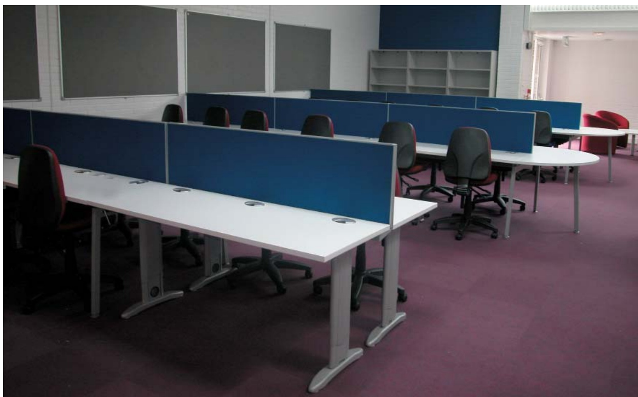
Learning Resource Centre furnished with Acclaim benching and Stretch height adjustable desks