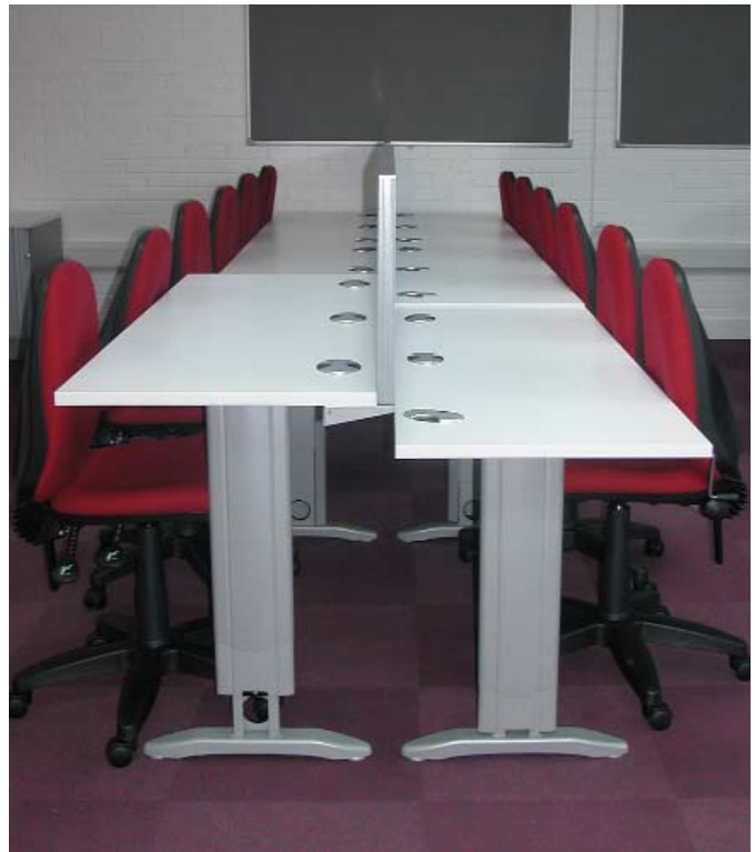
Height adjustable stations via crank handle

the school council and Pat Anderson was able to visit Eurotek's showroom to see the range in situ. 'We are very happy with the design and look of the room which will give us maximum flexibility and provide our students with a fantastic learning environment', commented Pat.