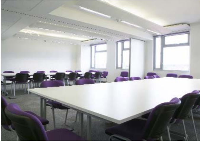
Meeting area with flip top tables