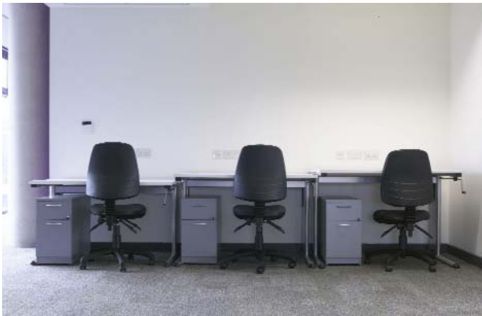
Manually height adjustable desks