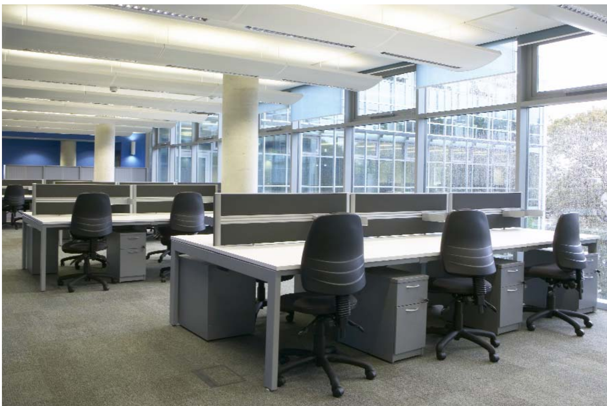
Access bench system in white and silver with low mobile pedestals