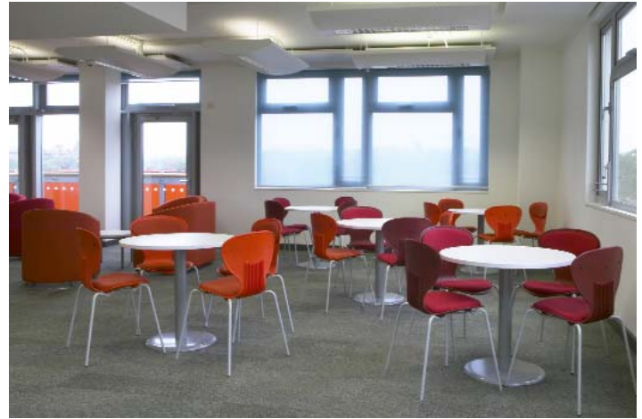
Bright breakout area/coffee area