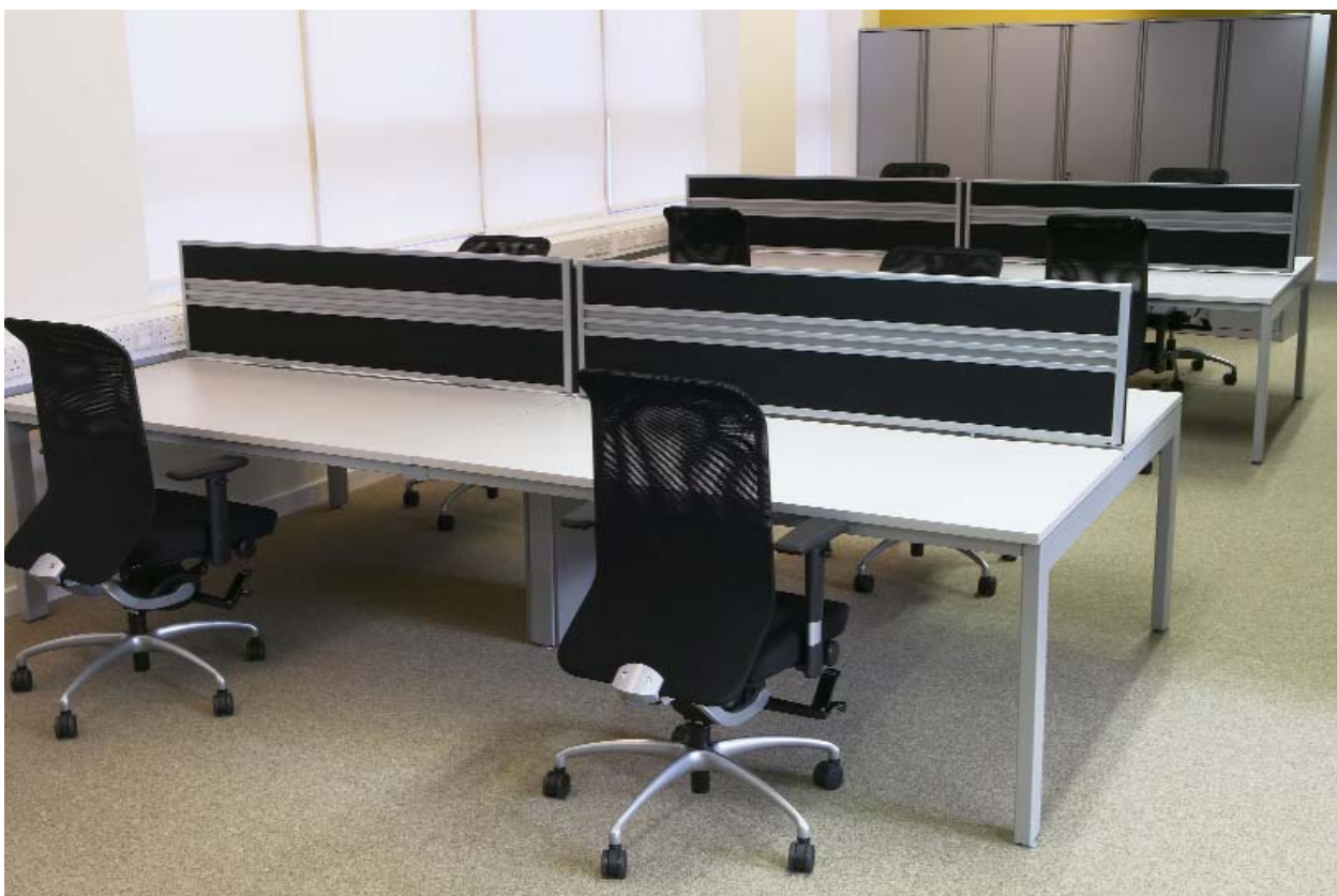
London Borough of Lambeth's monochromatic scheme on Access bench system