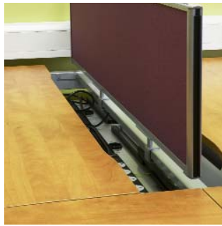
Flip top tables