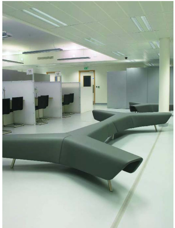
Waiting room bench seating from Hitch Mylius

LBL brief:- monochromatic, design led, bespoke furniture via our design partners, TV equipment.