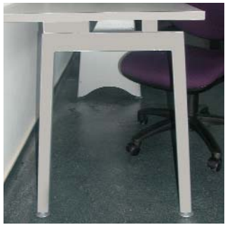
Strong frame structure