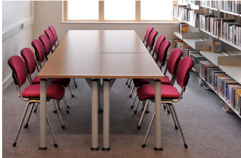
agio tables in library

Throughout this project, Eurotek worked with Quality Surveyors Potter Raper Partnership and the Project Management firm Mace.