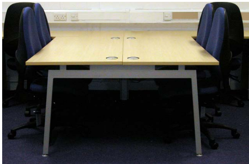
Back to back configuration