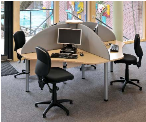
4 person quad workstation